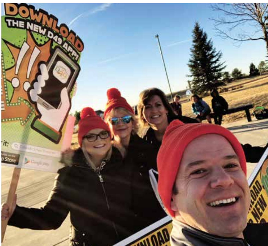
Communications team at SRES

O n January 8, 2019 D49 stepped into the digital marketplace with a free, mobile app. On the morning of the 8th, a volunteer group of staff alongside some D49 students fanned out to greet families and share the news of the app launch. Download the D49 app today in the App Store, or Google Play. Search Colorado School District 49, or go to d49.org/app for more info.