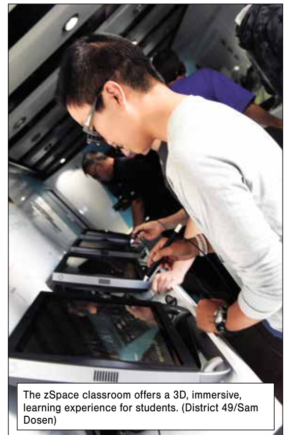
The zSpace classroom offers a 3D, immersive, learning experience for students.