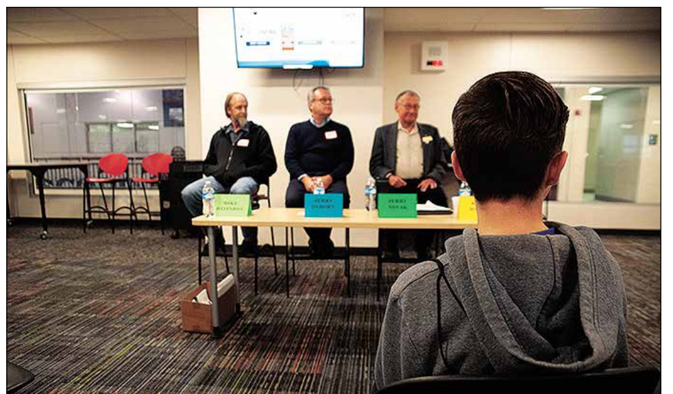
The skilled trades panel begins its presentation during the Get a Life Career Expo at Sand Creek High School Oct. 11.

Although the panelists explained the value