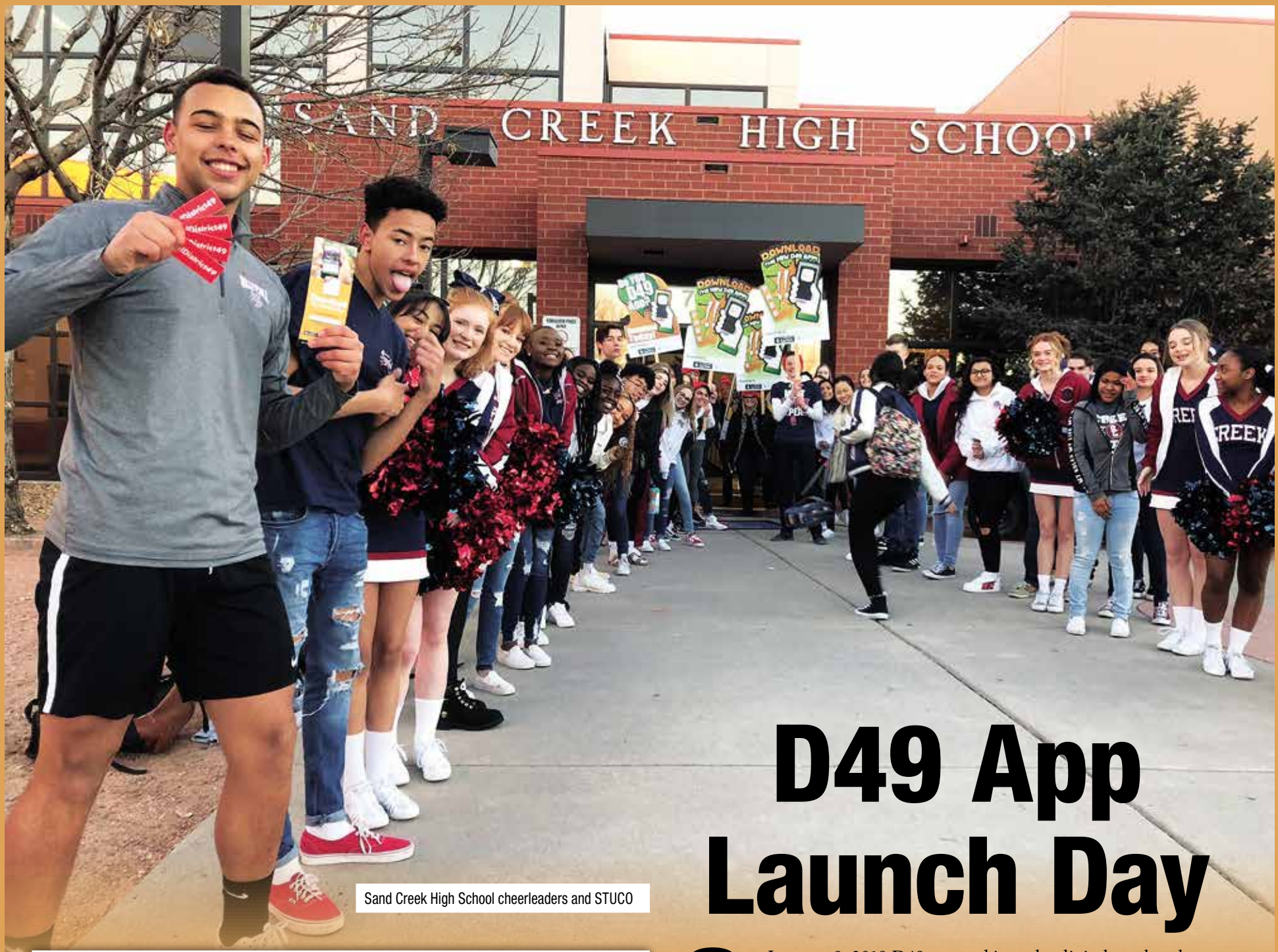
Sand Creek High School cheerleaders and STUCO