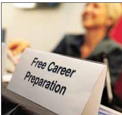
D49 Pathbuilders offered advice to visitors of the Get a Life Career Expo at Sand Creek High School Oct. 11.