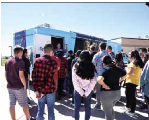
Vista Ridge High School students get instructions about interactive zSpace classrooms.

The virtual learning classrooms are scheduled to go online and hit the road by the start of the 2019-20 school year.