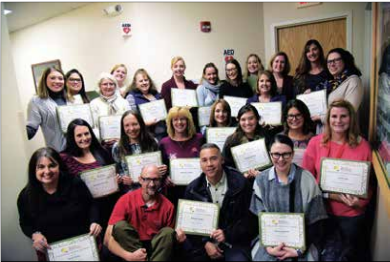
D49 teachers were presented mini grants from the Falcon Education Foundation during Fantastic 49 festivities Nov. 8 before the regular monthly Board of Education meeting. The foundation presented more than $26,000.